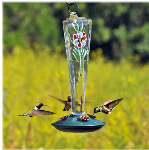
Hand painted glass hummingbird feeder $27.99