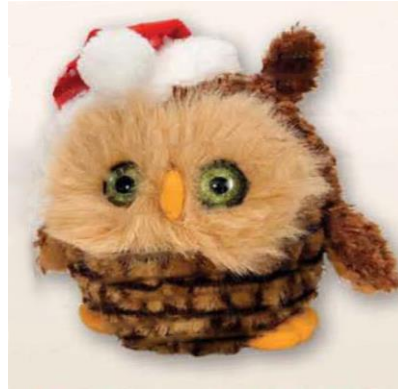
Holiday Owl 17 X 17cm $9.99