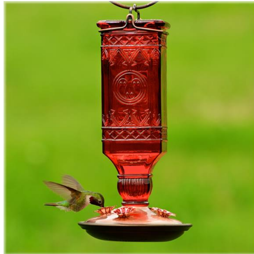
Antique red glass hummingbird feeder 24 ounces $21.99