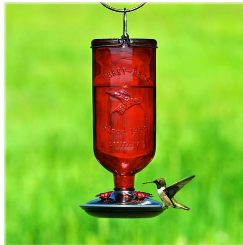
Antique red hummingbird feeder $19.99