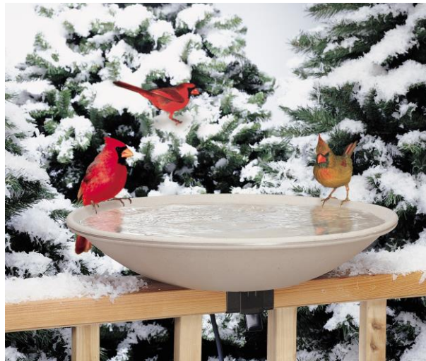
Heated deck bird bath 20" 115.99$

Winter is well on its way and the frost will soon freeze much of the surrounding water, depriving our feathered friends of an essential resource. In addition to using it as a drinking source, birds need water to clean their plumage in order to conserve its insulating qualities. This time tested quality product has been a favourite during the winter months at CCFA - Nature Expert.